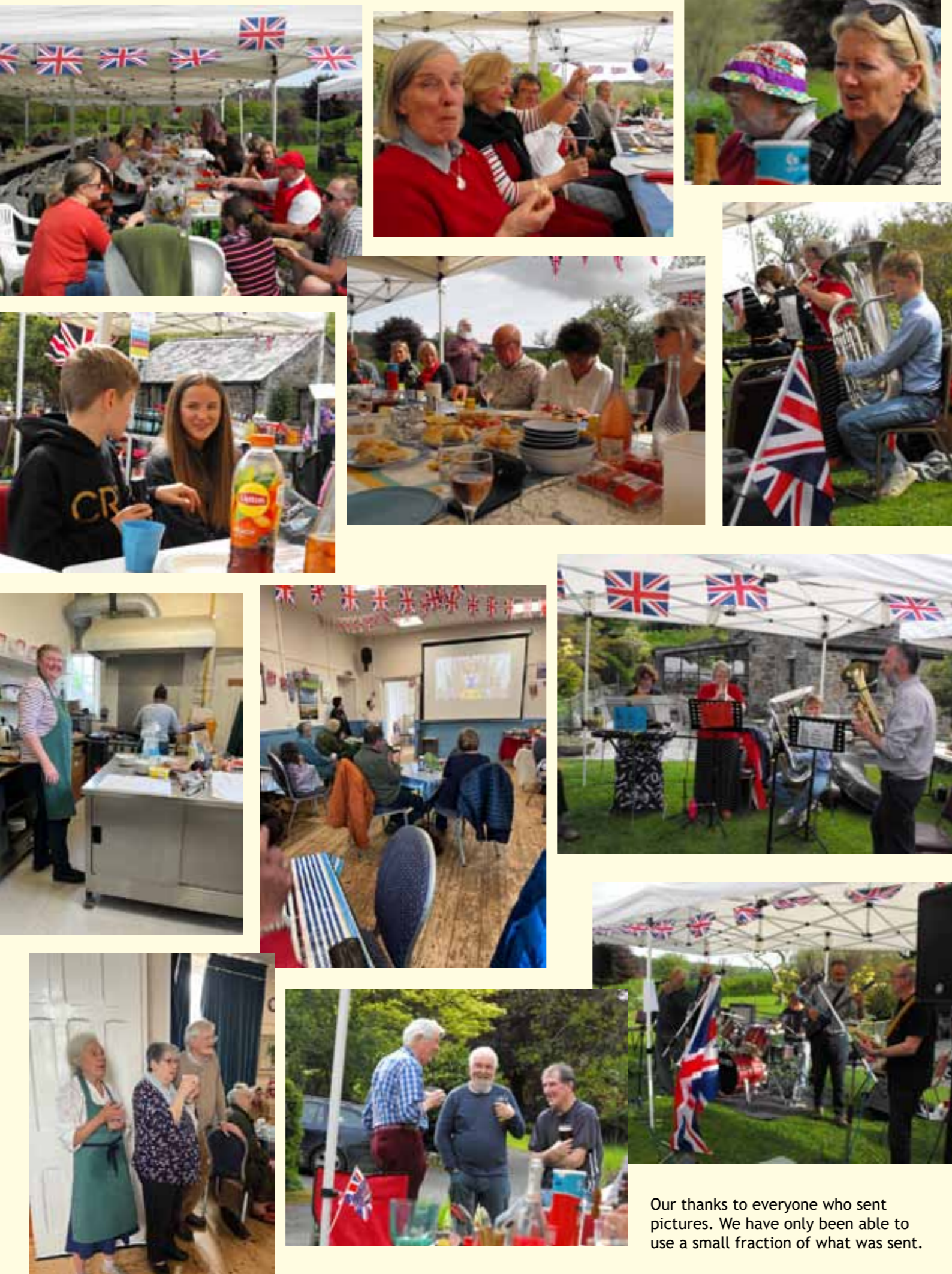
Our thanks to everyone who sent pictures. We have only been able to use a small fraction of what was sent.