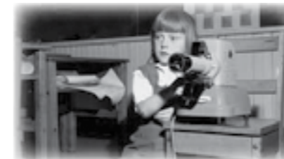
Could this be you?!